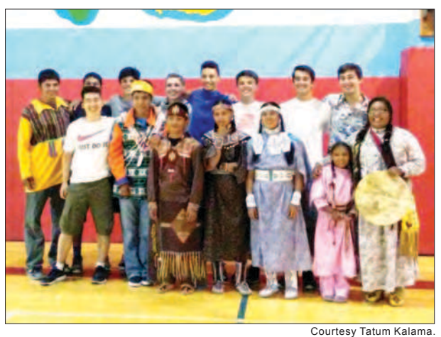
Volunteers and Social Dance group.

Recreation and the Community Wellness Center would like to thank the Green and Gold Volunteers from the Jesuit High School, and their parents.