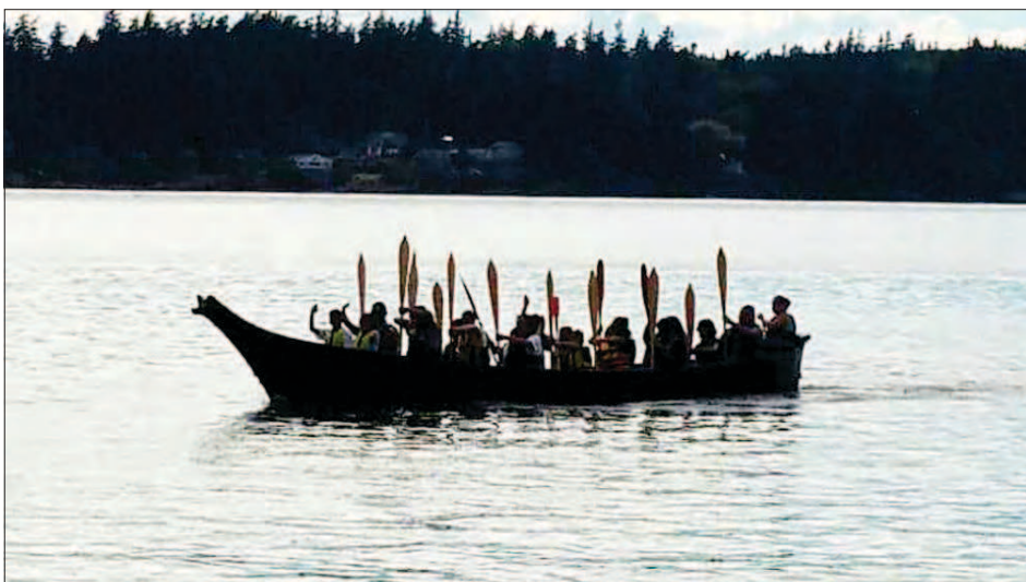
Leaving Swinomish on the way to Tulalip Bay.