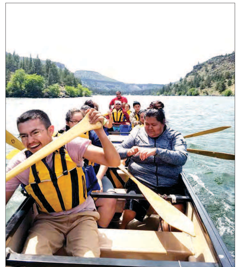
N'Chi Wanapum Canoe Family en route to