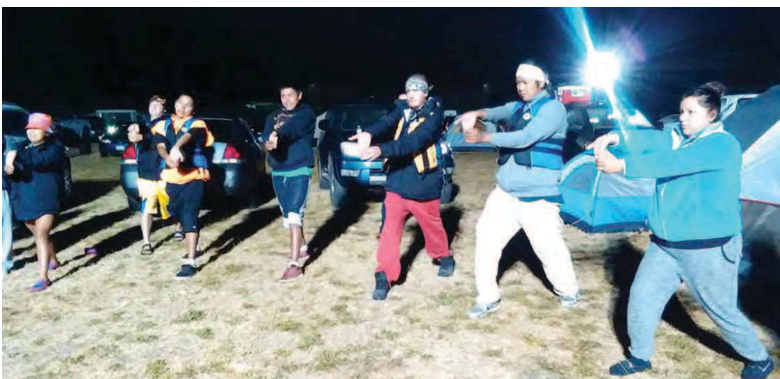
At the Canoe Family camp near La Conner, Wash.