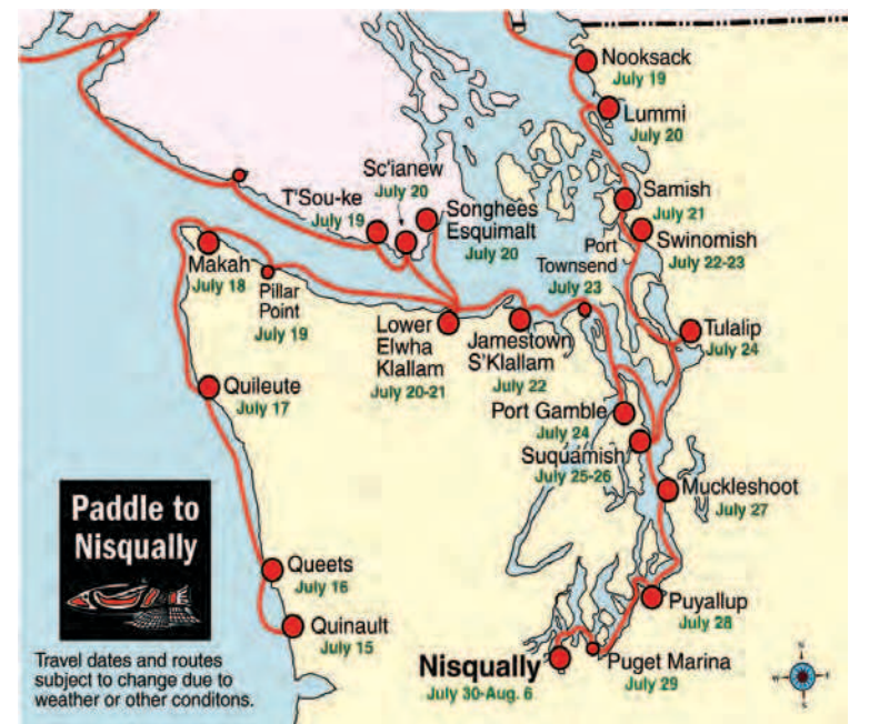
Map showing the routes and stopping points the Families followed to arrive at Nisqually on July 30.