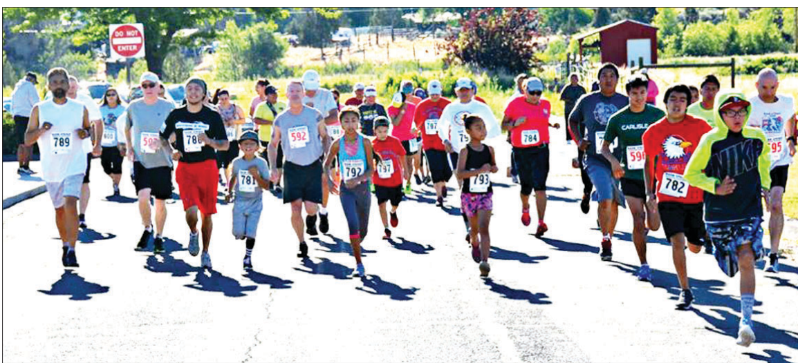
At the start of the 2016 Pi-Ume-Sha Run.