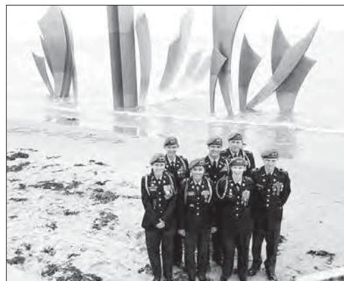
During the memorial ceremony at Sainte-Mère-Église (above); and at a Normandy Beach memorial (left).