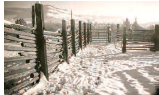
Some of the Health's photos are in brilliant color, while others are beautiful in black and white.