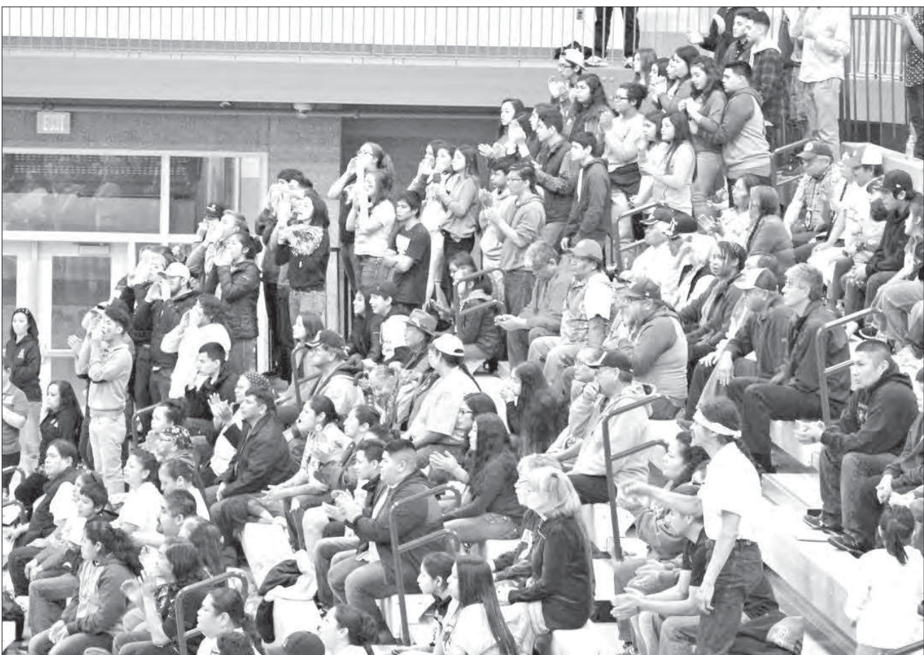
Many parents and other fans from Warm Springs went to the games.