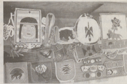
PB - 0339

915 SW Highway 97 - Across from the Truck Stop