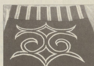
Shiraio Ainu gift bag presented to Confederated Tribes.