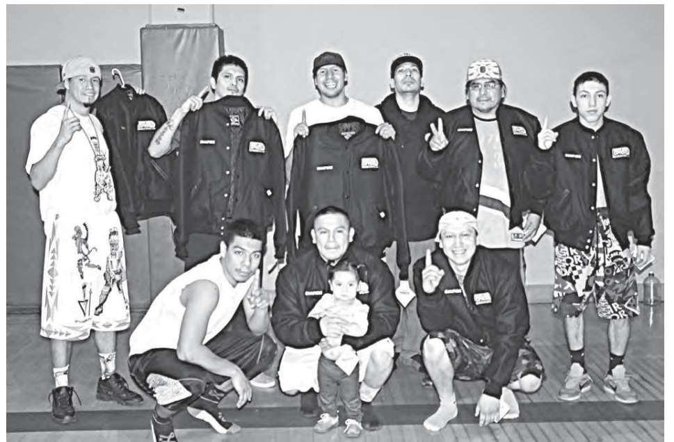
Springs Nation (above) won the men's division of the 2016 North End Express Tournament, held in January in Warm Springs. Smashtown (below) won the women's division. The tourney was hosted by Warm Springs Recreation.