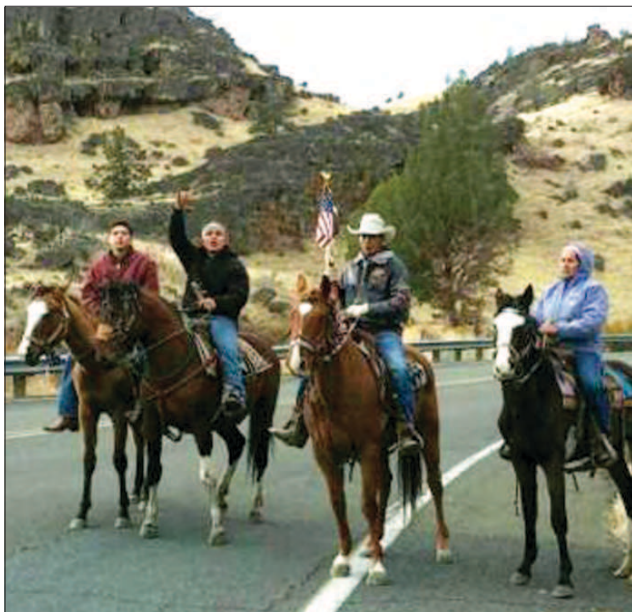
Runners and riders during the November 11 Tribute to Veterans.

gan at the Warm Springs VFW Hall and ended at Simnasho was because this was a Tribute to All Veterans, from the south end to the north end: For God so Loved the World that he gave his only begot-