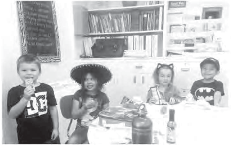
Students enjoy lunch in the principal's office as a reward for good behavior.