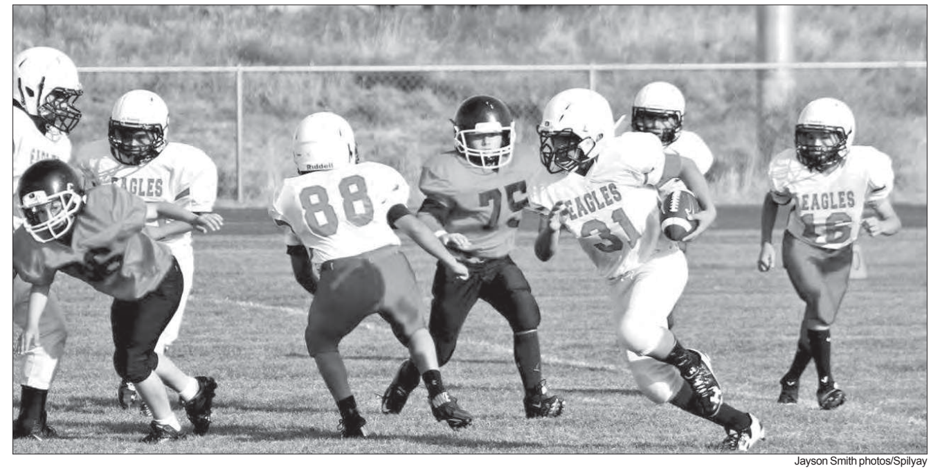
It's football season at the Warm Springs Eagle Academy, for the seventh-grade team (above), and the eighthgrade squad (below). The eighth-graders play at Sisters on October 6; the seventh-graders host Three Rivers on October 6. Game times are at 4:15 p.m.