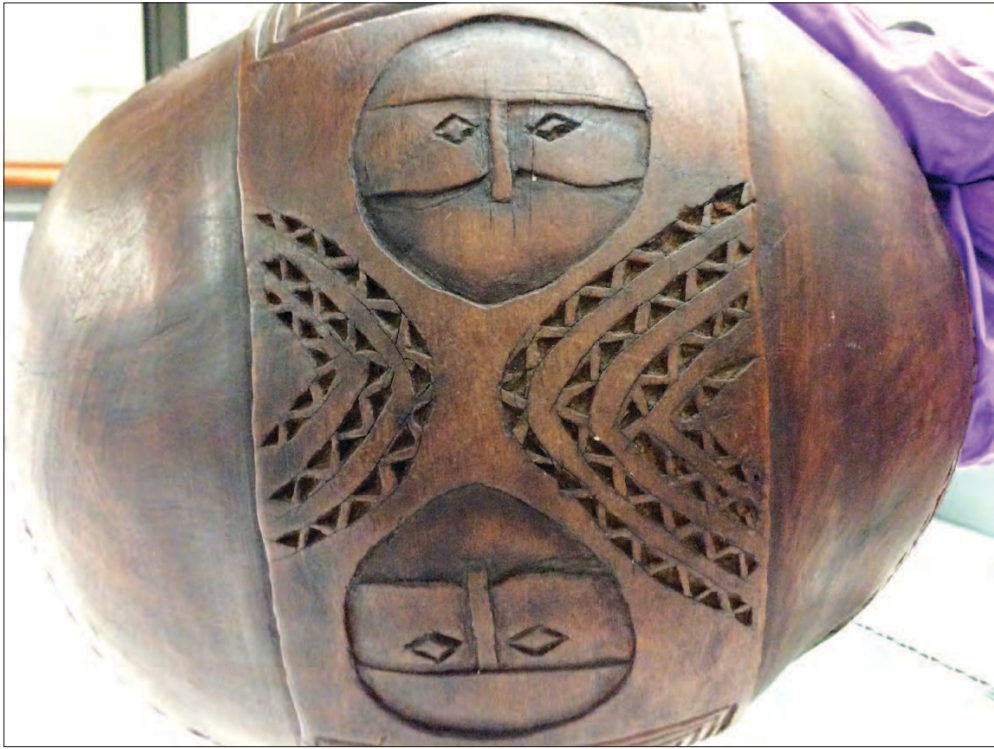
Bowl with carving of faces with no mouths. Val explains there is a Native legend about the Coyote giving the Indian people mouths.