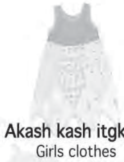
Akash kash itgkitit Girls clothes

The Warm Springs Culture and Heritage Department is located in the Education building. You can reach them at 541-553-3290.