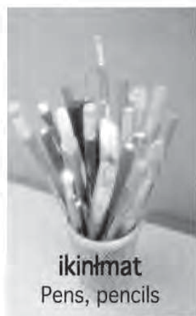
ikinimat Pens, pencils

Anxelgimlalama Itkitit kwadau Itchidikshoosh Idstaugen. I am going shop for clothes, shoes, and socks.