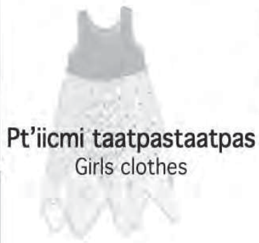
Pt'iicmi taatpastaatpas Girls clothes