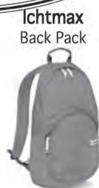
ichtmax Back Pack

Culture and Heritage is teaching the Rise and Shine youth language classes on Mondays, Wednesdays and Fridays at the Warm Springs Eagle Academy, from 7:40-8:50 a.m.