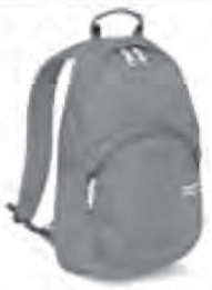
shaptpama Back pack