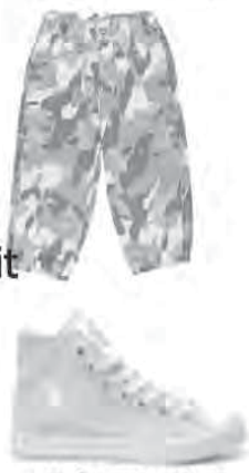
ididshoosh/ itchdikshoosh Shoes