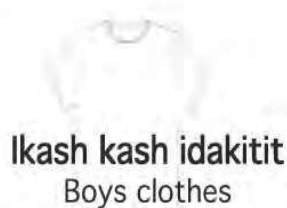
lkash kash idakitit Boys clothes