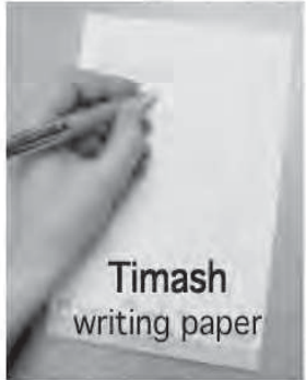
Timash writing paper