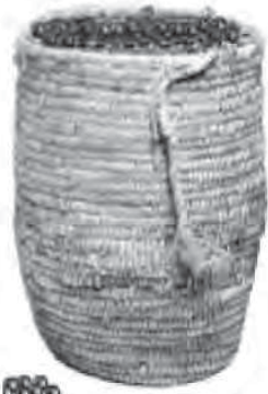
Kawona!! Kawona!! Baskets!! Baskets!!

U kawona mabetsabel! Get your Baskets Ready!