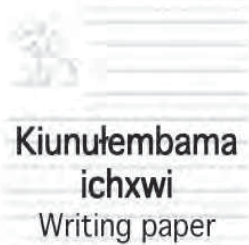
Kiunulembama ichxwi Writing paper