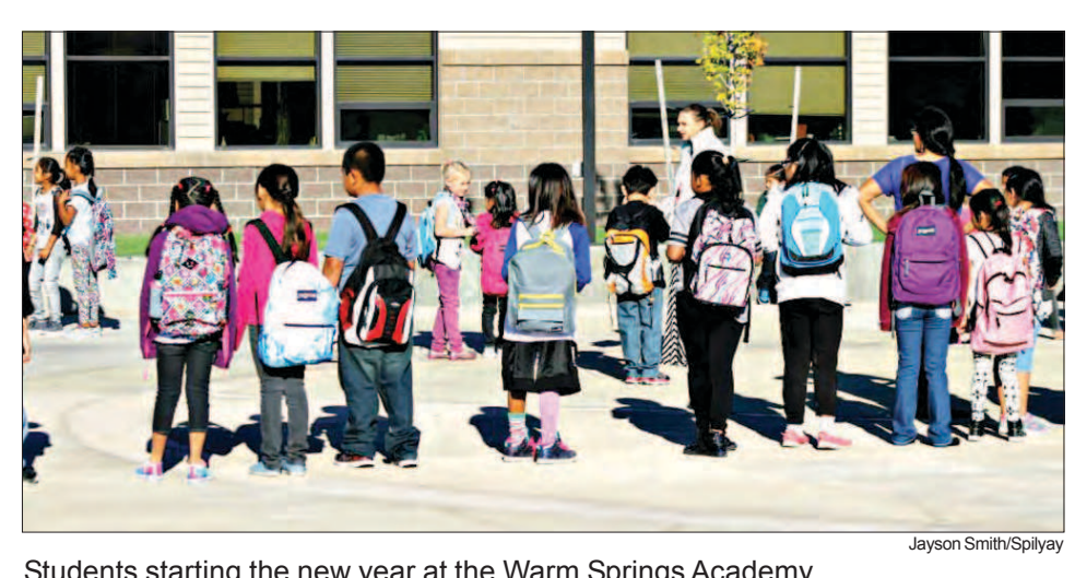
Students starting the new year at the Warm Springs Academy.