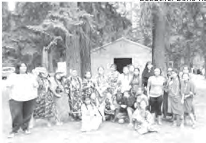
Sunday Service, most of the girls wore Tł'piip