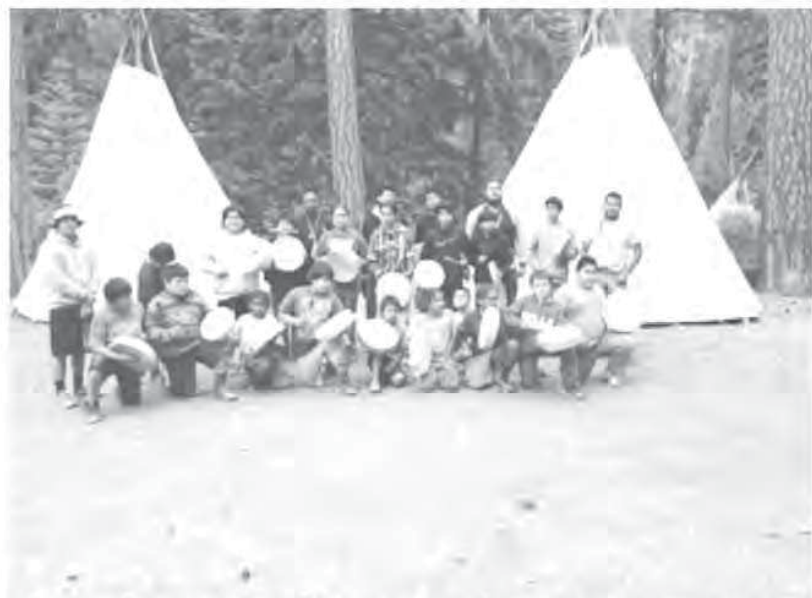
Boys showed there project, they all made hand drums, this was during Sunday Washat Service

There was a total of 45 campers (22 girls & 23 boys), to ensure safety & excitement there were 5 men counselors for the boys & 8 women counselors for the girls. Many of the Counselors were from Warm Springs Academy. The advantage of recruiting from the Warm Springs Academy was that there was a strong bond between the student and counselors and therefore a high level of expectation. Behavior management was minimal because the student/teacher relationship was already established throughout the school year.