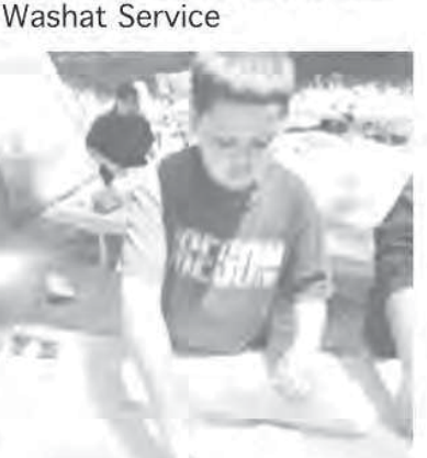
Fire & Safety EMT was right there with the Boys learning to make a Hand Drum. After he finished his he was helping the boys with there