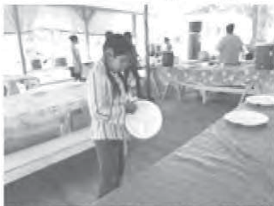
There were different girls that took part in preparing the table for each meal.