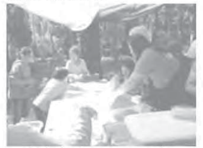
Girls learning to make fringe shawls

Everyone did an awesome job in all of the crafts.