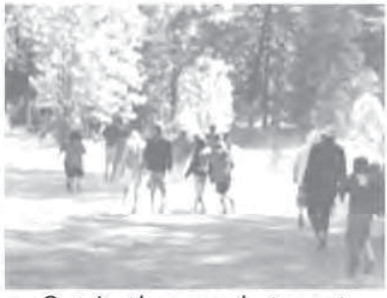
Out in the woods to get there perfect stick for there drum stick