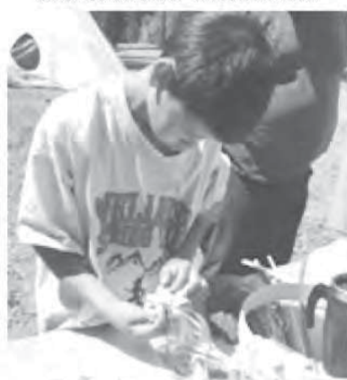
the amazing talent of unwinding the rawhide strings