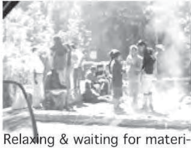
Relaxing & waiting for materials for Drum making