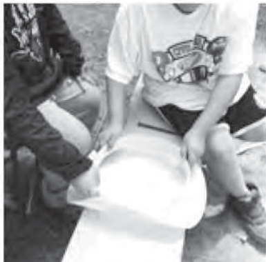
Measuring the hide to the hoop. Boys did a wonderful job and they were all excited making there drums