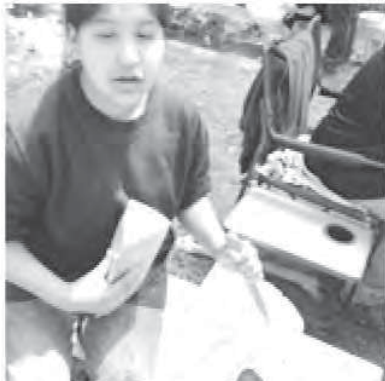
Everyone taking turns putting holes on the hide for the drum