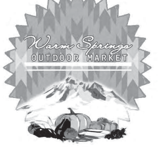
Every Friday at the Campus 10 a.m.-4 p.m.