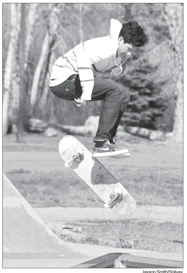
Skateboarder, basketballers and others gathered at Elmer Quinn Park last week for the Smoke Free Park event, hosted by Warm Springs Prevention.