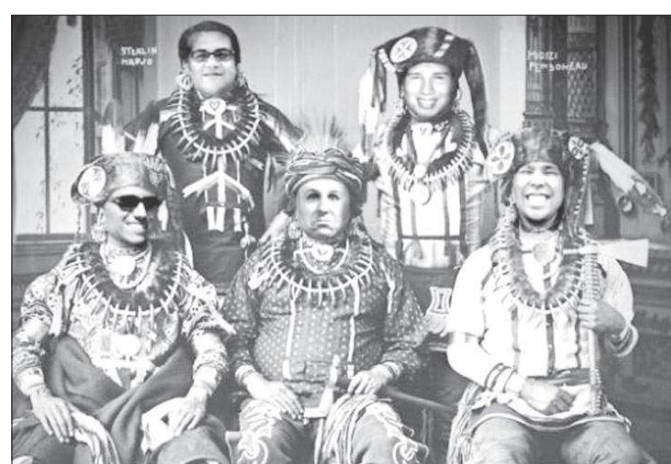
The 1491s are coming Nov. 14 to Bend COCC campus.

They coined the term 'All My Relations,'