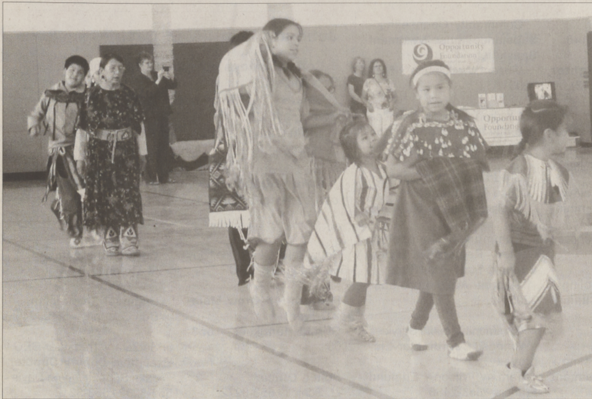
Youth Dance group performs.