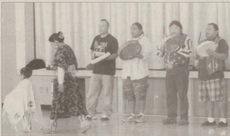
Drummers from Culture and Heritage performed for the Autni Ichishkin Sapsiqwala Dancers.

For information on the coalition, or on FASD, call 541-553-2211.