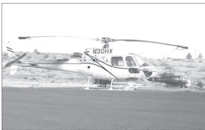
A number of helicopters were brought in last week to help with the containment effort.