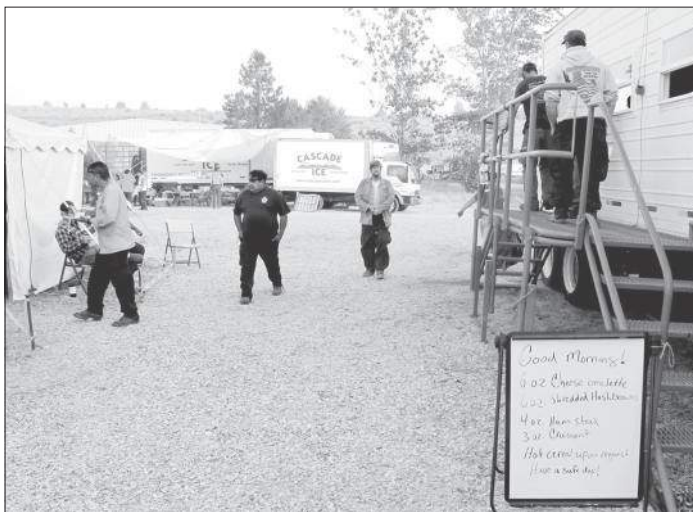
The day starts early at the fire camp, with breakfast from the food service team (housed in trailer at right).