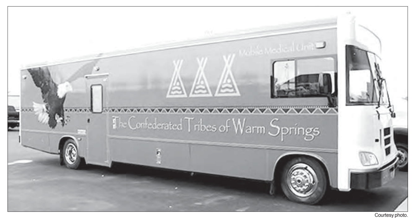
The Confederated Tribes' Mobile Clinic.

The Confederated Tribes of Warm Springs Mobile Medical Unit traveled earlier this month to Simnasho.