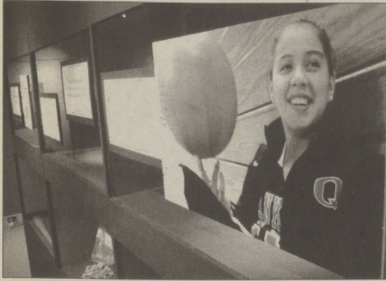
The Museum at Warm Springs is featuring the Native American athletes exhibit Winning Spirits: Native American Youth and Athletics . On display through June