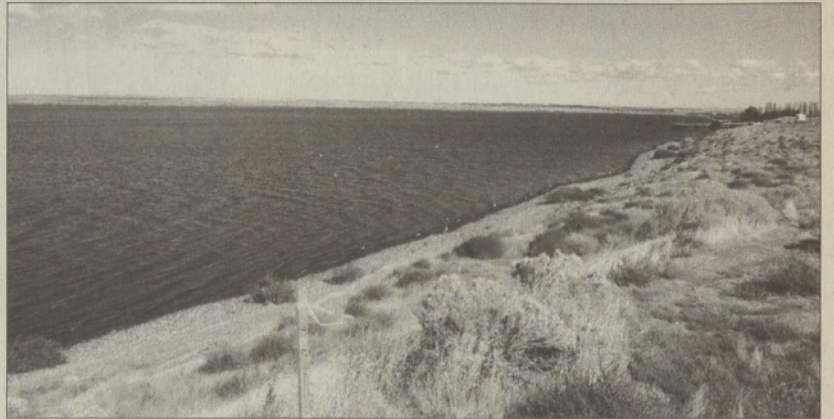
Tribal fishing site within the proposed Port of Morrow development site.

(Note: Ambre Energy is proposing the Coyote Island Terminal, to be constructed at the Port of Morrow for coal storage and barge loading. The Confederated Tribes of Warm Springs is among the tribes that are opposing the plan. The following is a recent statement by Paul Lumley, executive director of the Columbia River Inter-Tribal Fish Commission.)