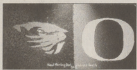
Ceiling tile art.