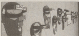
Baby board, Warm Springs youth.