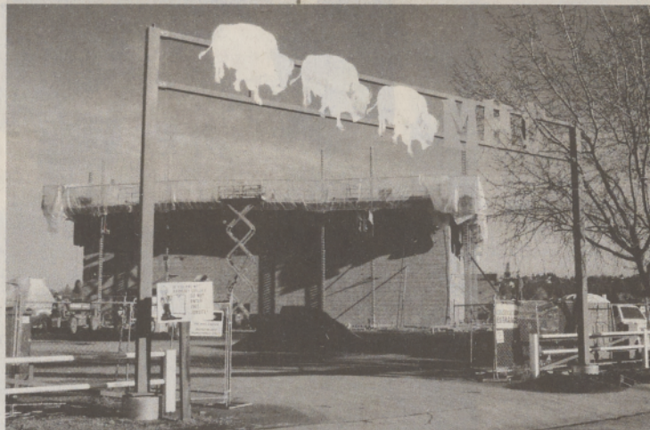
MHS community Performing Arts Center