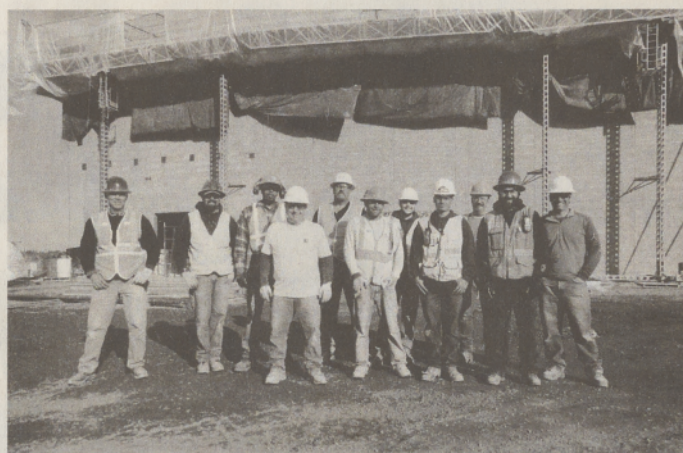
The Skanska construction team enjoys a break from the harsh weather.