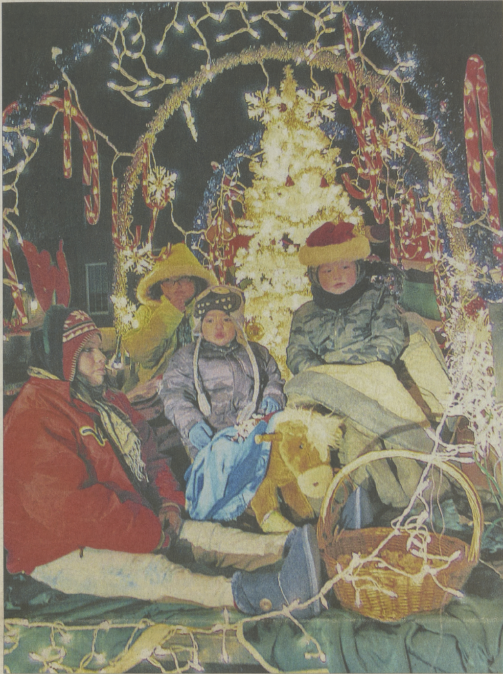
Parade riders bundled up against the cold.

KWSO is offering on-air promotion for organizations, businesses and artists who donate a new product or service for the auction.