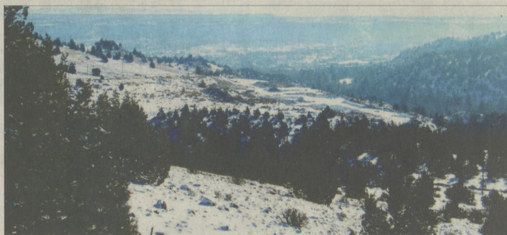
The development site is by the Brunoe rock pit up the grade past the elementary school.