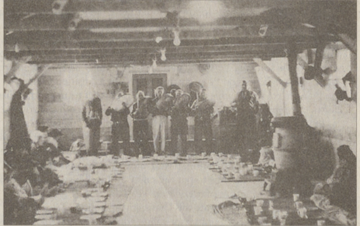
In the longhouse.