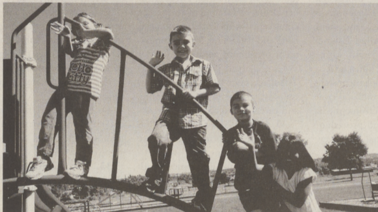
Thanks to Kiwanis, Rotary Club and community members, students have a new place to play!