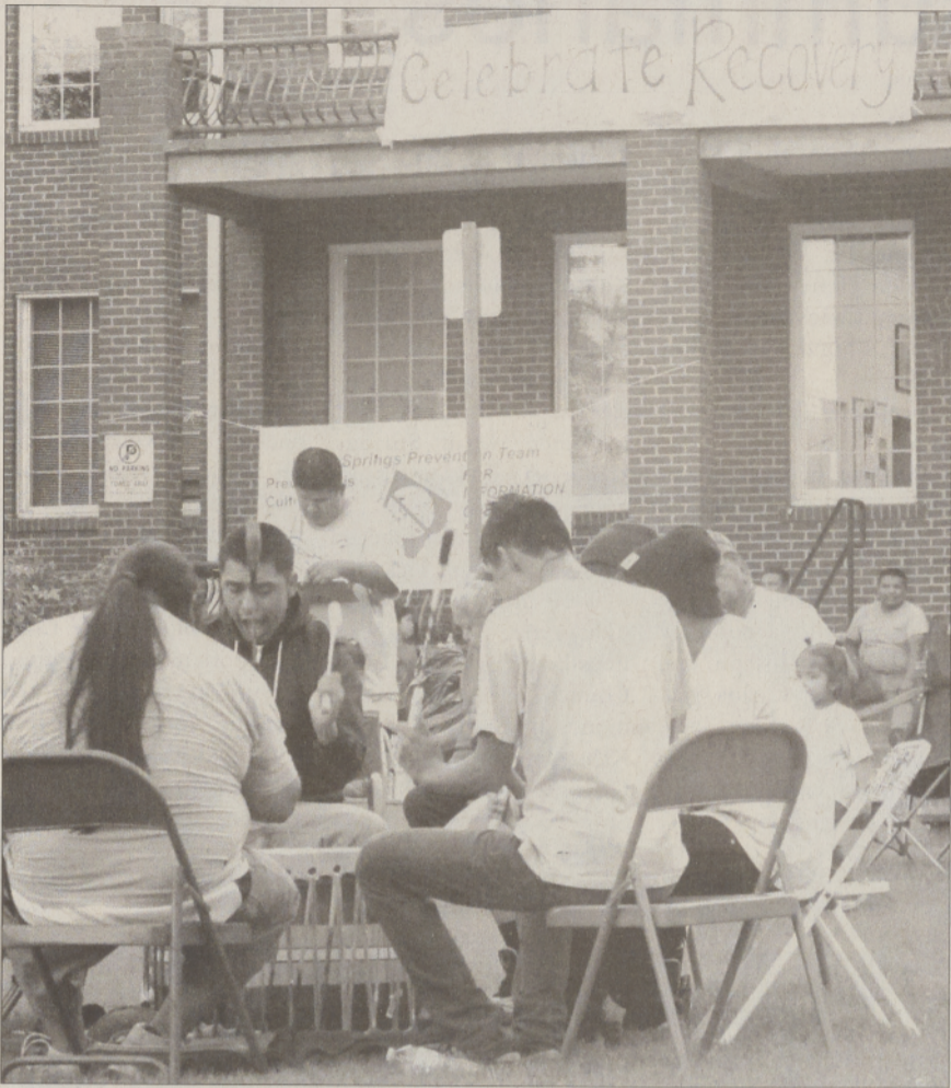
Drum group Rolling Thunder (pictured above) along with Eagle Thunder and Quartz Creek were keeping the Back to School and Sobriety Powwow going even after the sun went down.

September is National Recovery Month. The observance educates Americans on the fact that addiction treatment and mental health services can enable those with substance use or mental disorder to live a healthy and rewarding life.