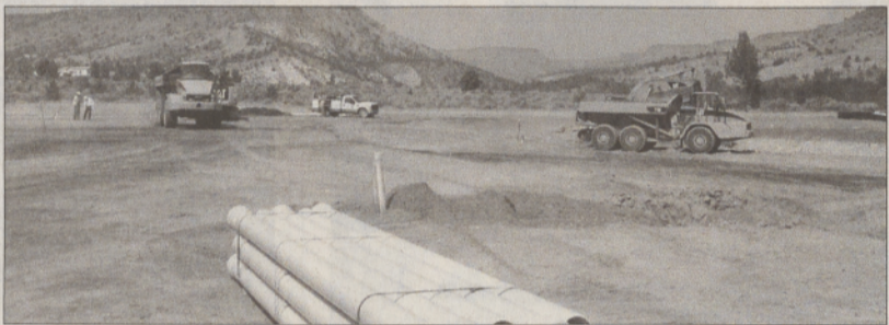
Heavy machinery is at work levelling the school site. The outlines of the sports fields and the main building areas are now coming into view.