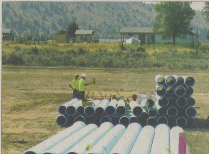
The water lines arrived on the site last week.

At the Warm Springs k-8 site, about 25 workers are on hand, including a number of tribal members. To learn about employment opportunities at the site, call Job Cre-