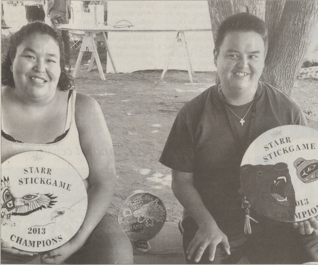
Starr Stick Game champions from LaPush, Washington, with drums and trophy..

The Starr family hosted the Annual Stick Game Tournament at the Forty-Fourth Annual Pi-Ume-Sha Treaty Days Powwow. These are the results of the tournament: