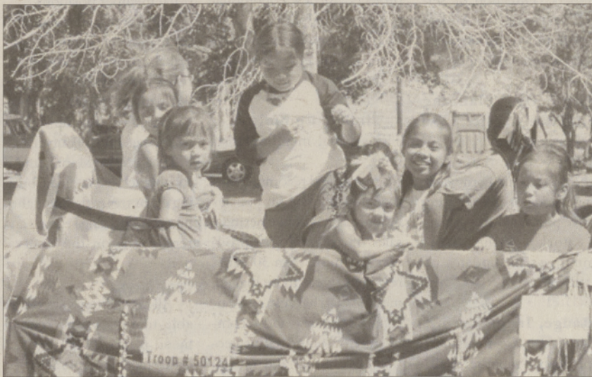
First-place Traditional Community float, the Girl Scouts.

Theme: First, Warm Springs Recreation; second, KWSO radio 91.9 FM.