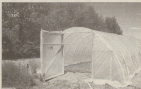
A finished hoop house