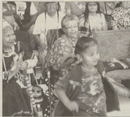
The ECE powwow is a highlight of the day. Cooks (above at right) prepare salmon for lunch.