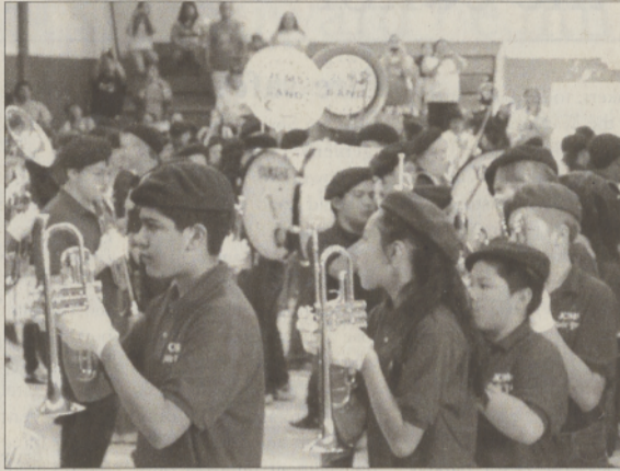
The Jefferson County Middle School Band performed during the early part of the day.