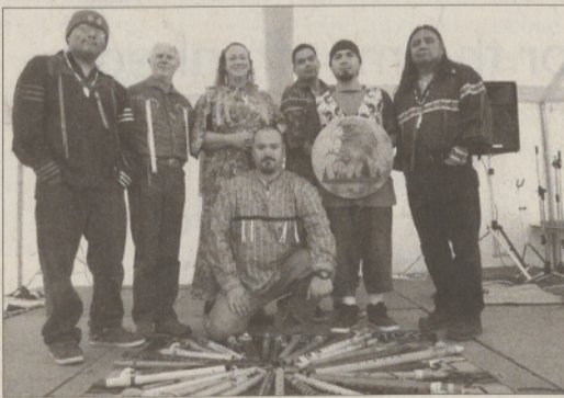
Native flute players plan May gathering

The Gathering of Flutes by the River is set for May 31-June 2 at the HeHe Longhouse. All are welcome.