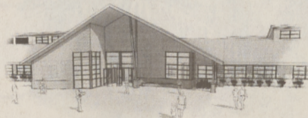
Design layout of Warm Springs k-8 school