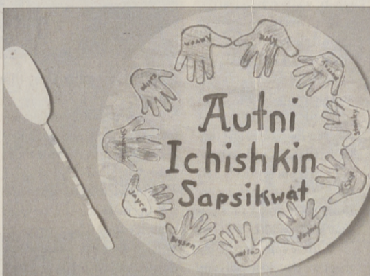
The opening reception was last week in the Museum at Warm Springs lobby (above left); and artwork is on display in the Changing Exhibits Gallery.