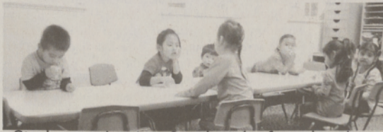
Students take time for chuush after play time