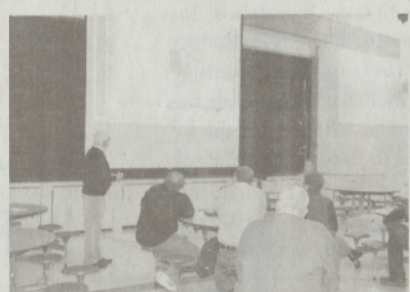
Local community members and JCSD staff gather with consultants to discuss district-wide construction projects resulting from the recent school bond passed by voters.