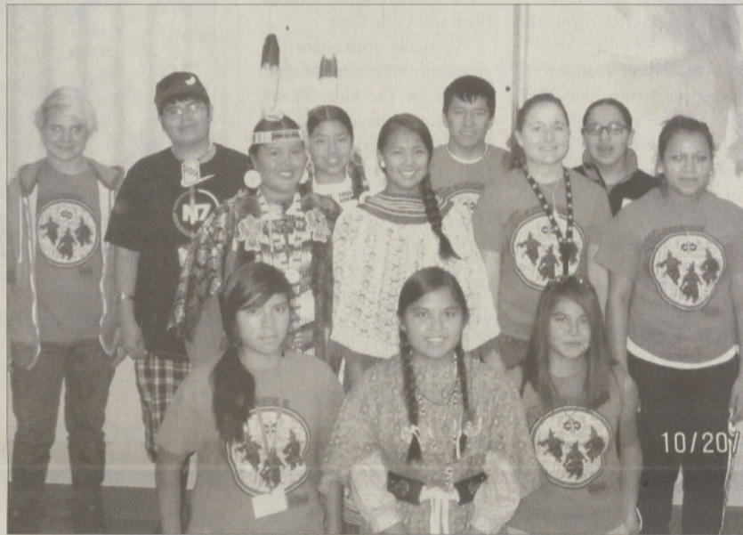
Madras High School students at the National Indian Education Conference in Oklahoma City.