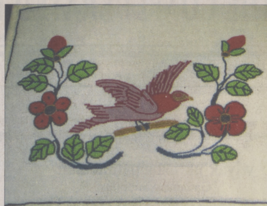
Stop by the Museum at Warm Springs to see the 2012 Tribal Members Art Exhibition.