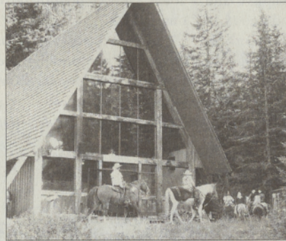
The Native American Heritage Center.