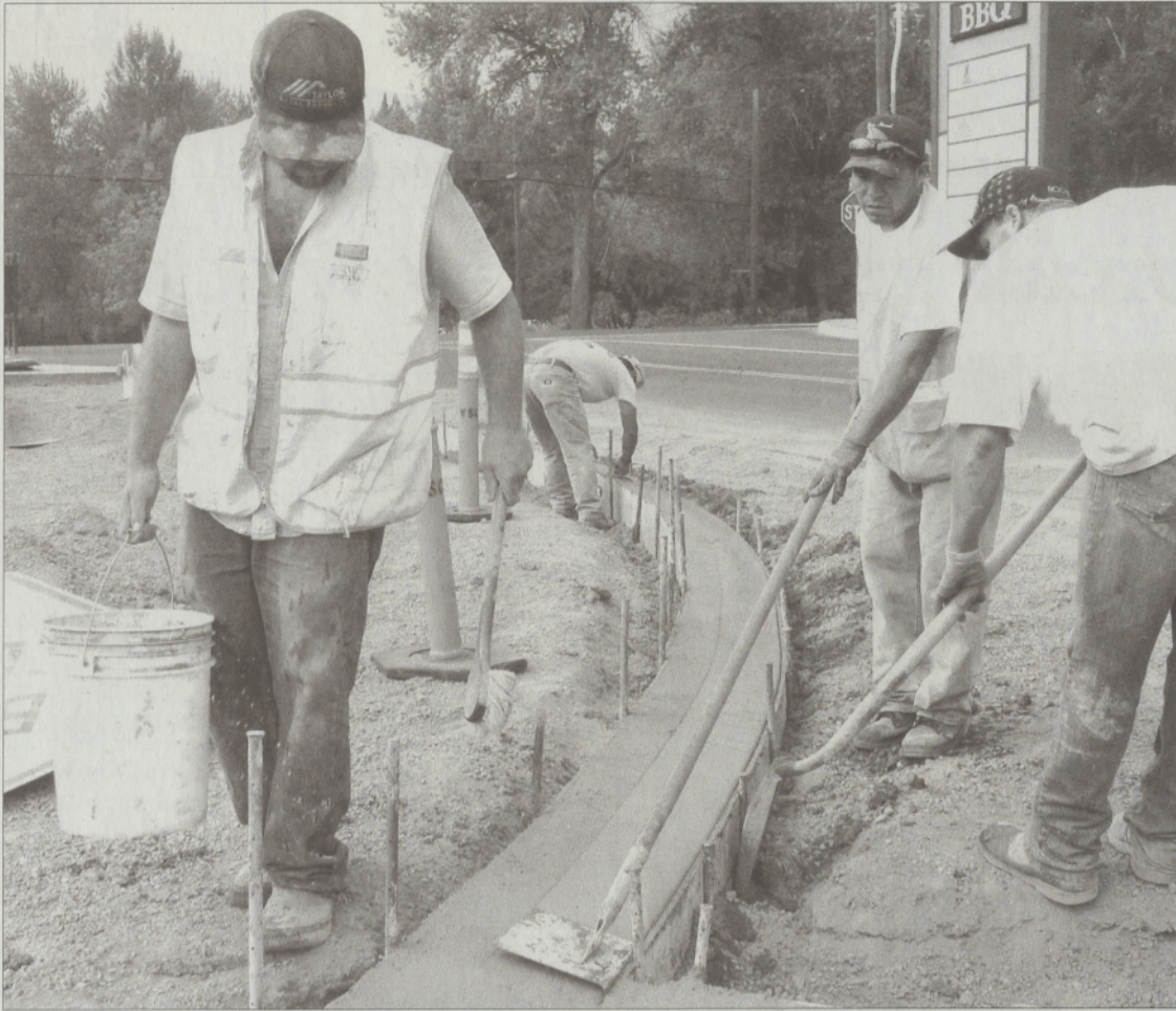
The highway access work at Indian Head casino is nearing completion. The addition of the turning lanes is finished, and the construction crews are now working just off the highway by the casino parking lot areas.