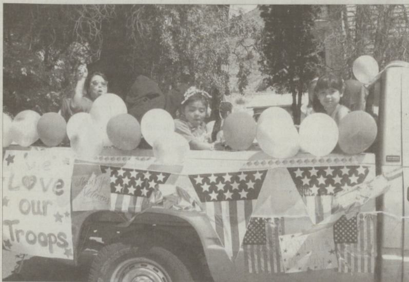
Float honoring veterans.