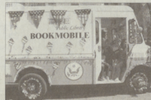
Library book mobile was a parade winner.