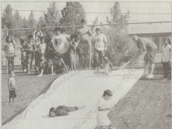
The Fourth of July activities includes a slip-n-slide on the hill by the community center fields.