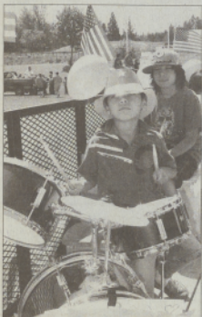
Church group provided the music.