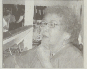
Spilyay staff photos