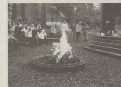
Students from throughout Oregon enjoy a camp fire during an outdoor science camp at the 4-H Center in Salem, Oregon.

In early May, fourth and fifth graders from Warm Springs Elementary attended an outdoor science camp at the 4-H center in Salem, Oregon. These students are part of the afterschool SMILE (Science & Math Investigative Learning Experiences) club. SMILE club students from Nyssa, Ontario, Siletz, and Pendleton shared the experience and created opportunities for WSE students to make new friends. Students worked on field studies in the areas of water, animal life, plant life, and geology. All of the students greatly enjoyed evenings at the campfire learning new songs and performing skits. Everyone had a great time, despite the fact it rained nearly the entire time!