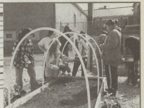
MHS Transitional Program students enjoy and learn in a community garden at Westside School.