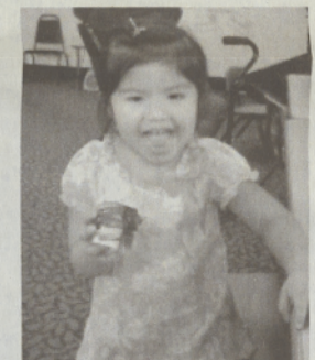
Sun Hawk-mi wápas Sun Hawks Wapas!