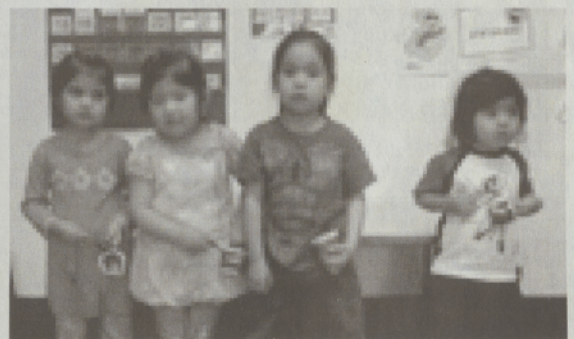
Kwala pa aniyáa wápas! They are happy they made a wapas!