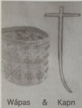
Wápas & Kapn