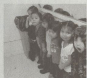
children showing respect and patience for the other students.