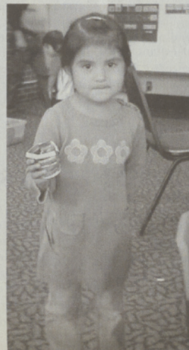
Skye-Mi wápas Skye's Wapas!

The students proudly display their hard work there very happy learning and taking part in all cultural activities.