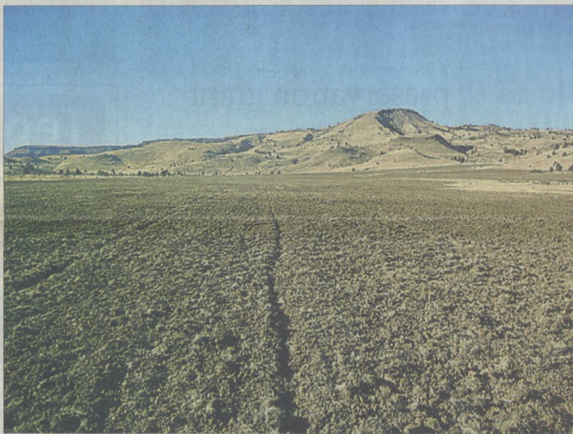
The 500-acre Moody Farm near Kah-Nee-Ta will be the new tribal farm.

The March 28 dedication ceremony begins at 10 a.m. with the invocation